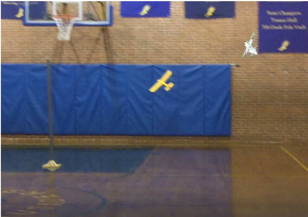
Indoor Pylon race start! Jerry Worden (yellow) vs Justin Worden (green/white)