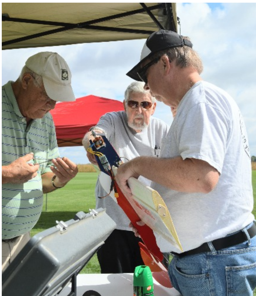
Surgical repair on an electric Ringmaster following a mishap!!!

Meetings shall be conducted following the procedures indicated in " Robert's Rules of Order ".