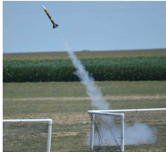
Great Fun At The Open House!!

AMA District VI Chapter 621 Founded in 1964