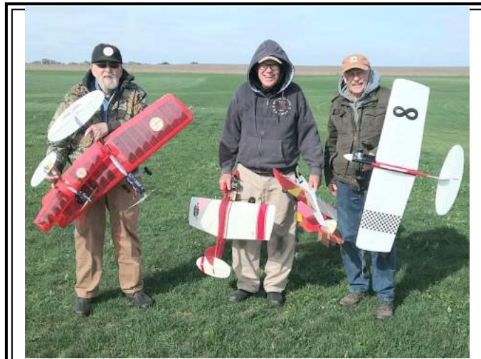
Three of the 4 SIRS pilots that braved cold windy weather to fly Ringmasters in the 11 th Annual Worldwide Ringmaster Fly-A-Thon!!

AMA District VI Chapter 621 Founded in 1964