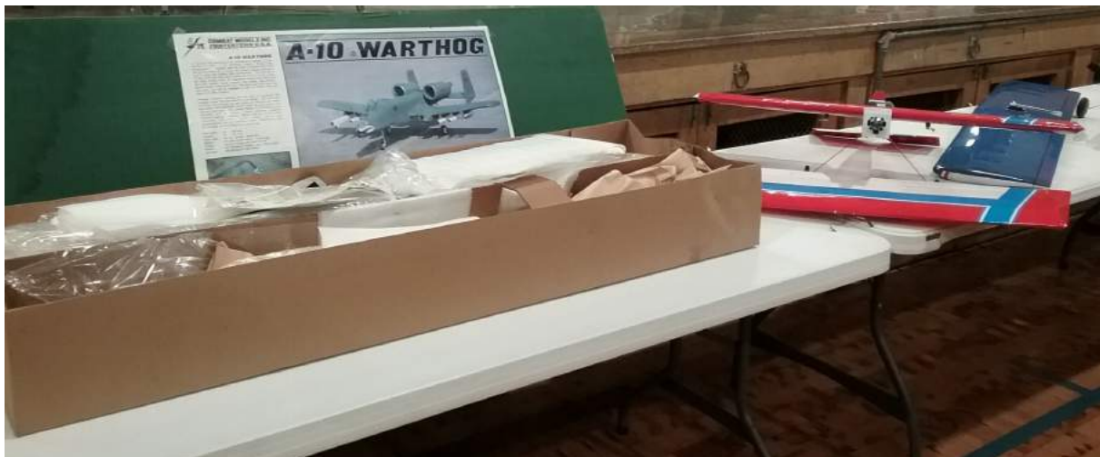
A few of the auction Items!!