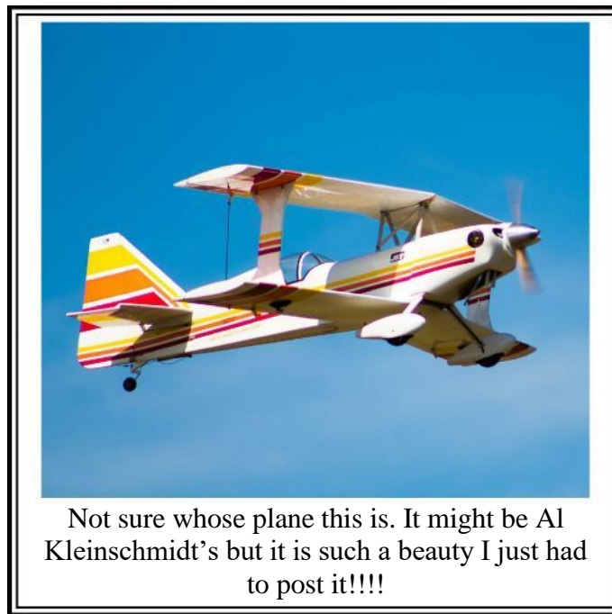
Not sure whose plane this is. It might be Al Kleinschmidt's but it is such a beauty I just had to post it!!!!

AMA District VI Chapter 621 Founded in 1964