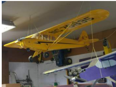
Yellow Piper cub NC70895 $125 (engine unknown)