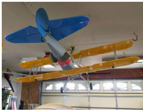
Stearman thinking 1/5 scale O.S. 4 stroke engine $230