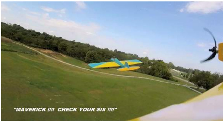
Super Ringmaster Flying for the 11 th Annual Worldwide Ringmaster Fly-A-Thon Breezy Hill RC Flying Field in Southern Illinois

2018 Members, your dues for 2019 will be due JANUARY 31 st !!