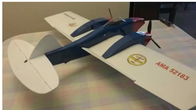
Above is my "one of a kind" electric twin 526 Ringmaster.