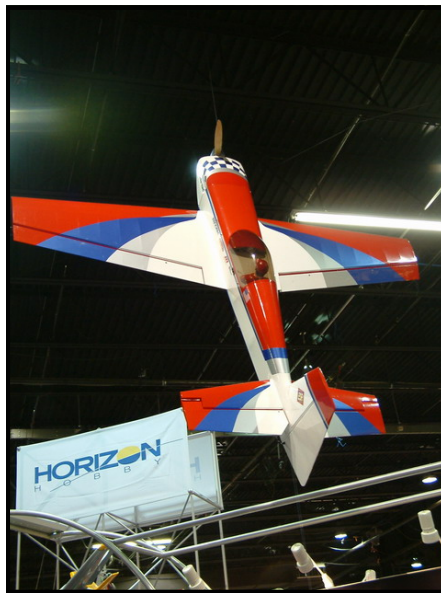
The new Hangar 9 33% Extra 330S ARF was on display over the Horizon Hobby area.