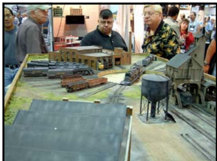
Model railroad enthusiasts ponder the intricacies of an elaborate round house setup.