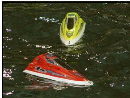
Hobbyzone Zig Zag racers prepare to compete in the Inside RC Triathlon water event.