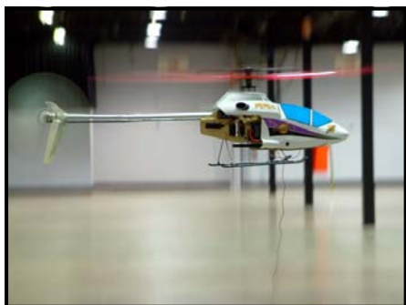
A Light Machines Corona hovers in the copter cage demonstration area.