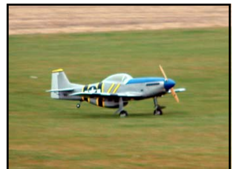
SIRS Field, October 11, 2003 — (Left) Chris Cochran assembles his Giant Scale Planes P-51 for its maiden flight. (center) The assembled model (right) The first flights were flown successfully, but ended in dead-stick landings. Chris' plan has a wingspan of 100" and weighs 27.75 pounds. It's powered by a 3W75 motor and features Robart retracts and scale wheels.