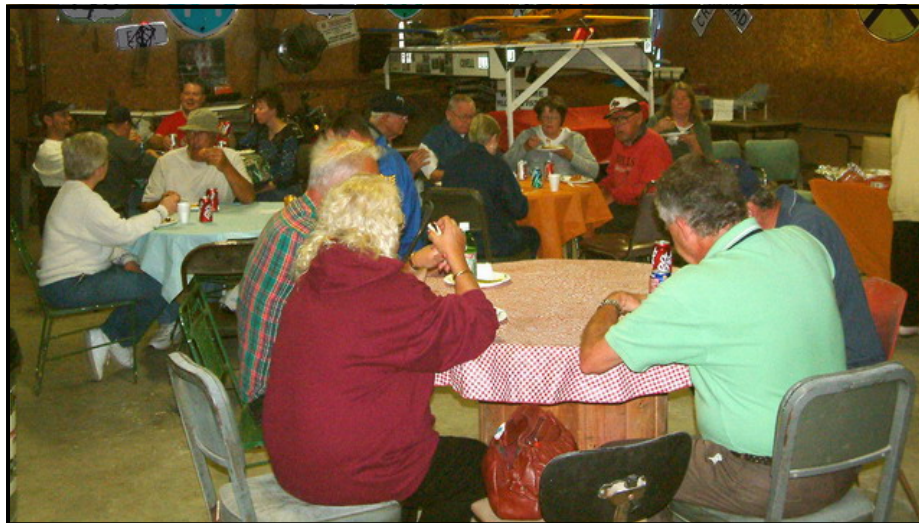
SIRS members chow down at the wiener roast held prior to the September 13 monthly meeting